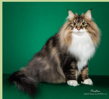
Norway.