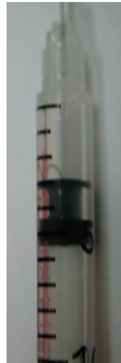
#3 3 units