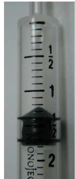
#4 1.4 mL