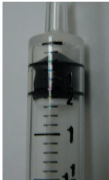
#3 0.2 mL